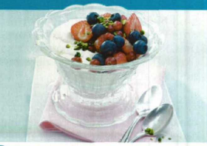
Dessert 1 cup fresh berries with 1 cup plain Greek yogurt