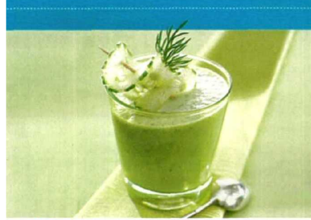
Afternoon snack Juice 2 stalks fennel with leaves, 1 cucumber, 1 green apple, 1 handful of mint and 1" chunk gingerroot