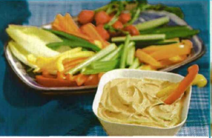
Morning snack Fresh vegetable crudités with hummus